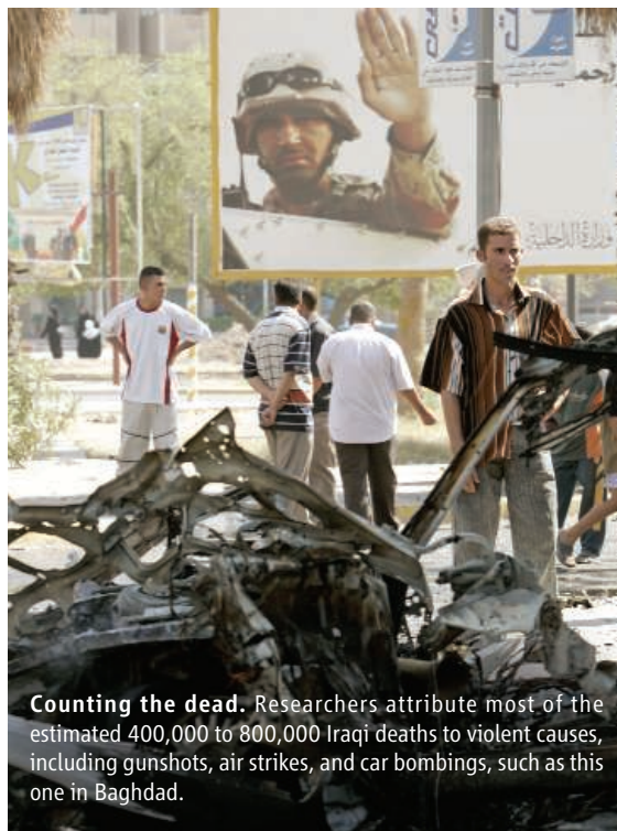
Counting the dead. Researchers attribute most of the estimated 400,000 to 800,000 Iraqi deaths to violent causes, including gunshots, air strikes, and car bombings, such as this one in Baghdad.

The Lancet study, designed by researchers at Johns Hopkins University in Baltimore, Maryland, is based on a survey conducted between May and July by a team of 10 Iraqi health workers. (The Johns Hopkins researchers met with the Iraqi team twice across the border in Jordan to advise on the survey techniques.) The team visited