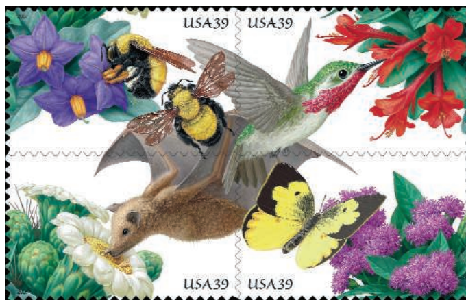
Stamps of approval. Next spring, the U.S. Post Office will issue these and other stamps depicting pollinators.

seeds, and nuts—that rely on animal pollinators, which include beetles, butterflies, flies, bats, hummingbirds, and bumblebees. But the king of pollinators is Apis mellifera , the European honeybee. Much preferred over its African cousin, it’s a “generalist” that pollinates a huge variety of crops. It is also highly social and thus easy to muster.